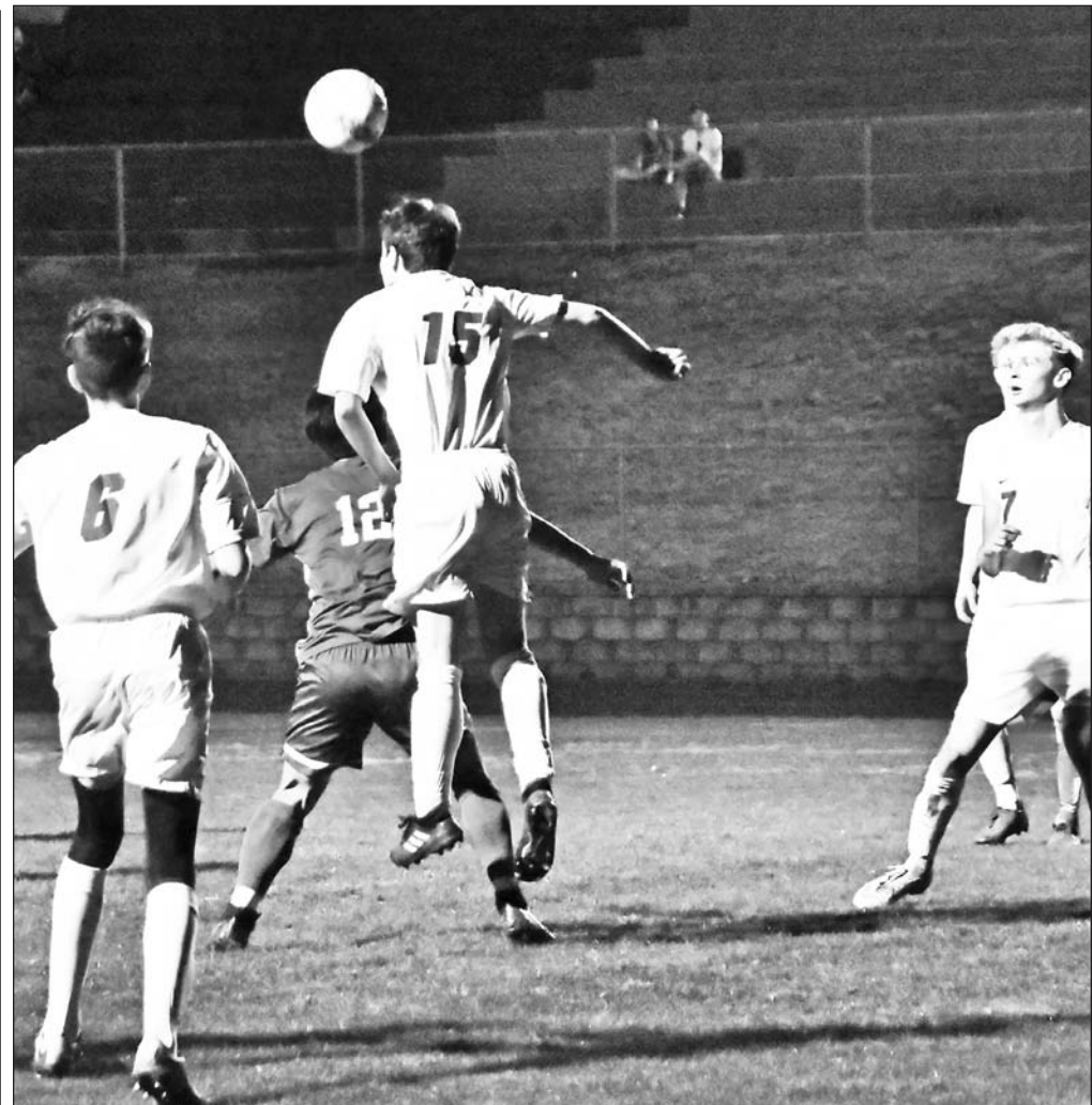
Towns County Indian and Lady Indian soccer

Soccer is a great outlet for any kid to come out and have fun no matter what their skill level might be. If you are looking for a wonderful environment for your child not only to excel individually in a sport, but also as a team, then soccer is the name of the game. TFeb28,FJSH